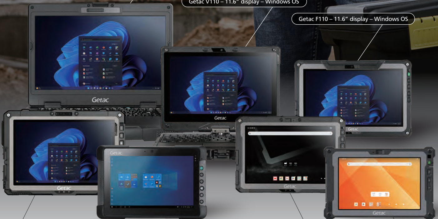
Getac UX10 - 10.1" display - Windows OS