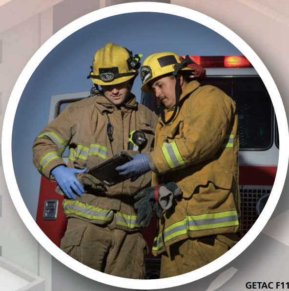
GETAC F110 3D EXPERIENCE

Turn any emergency vehicle into a command centre with Getac Solutions. Our rugged laptops and tablets offer fast and powerful wireless connectivity technology to ensure critical incident information is available in real time.