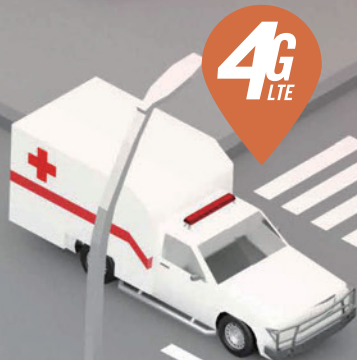
GETAC UX10 3D EXPERIENCE