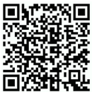
K120 3D demo